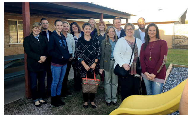
Community Impact Review Team members visit Abilene Hope Haven's Bridge 2 Home shelter.

Each year, United Way of Abilene coordinates more than 60 volunteers to serve as Community Impact and Stewardship Review Team members. These volunteers review the program outcomes, efficiency, and management of applicant programs. This process ensures that your investment in United Way is used efficiently and effectively.